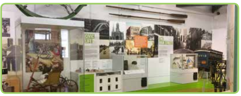
Somewhere in England

Local geology and archaeology from prehistory to the 1400s.