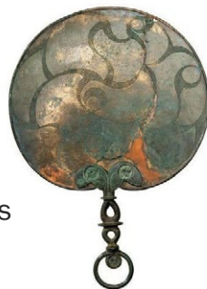
Bronze mirror found at Old Warden, Bedfordshire, c.1st century BCE