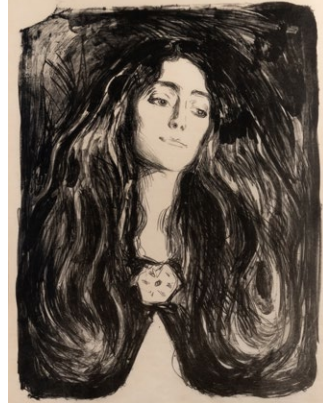
Edvard Munch (1863–1944), Woman with a Brooch (Madonna) , 1903 © Cecil Higgins Art Gallery (The Higgins Bedford)

Drawn from the internationally renowned Cecil Higgins Art Gallery Collection, explore artists' depictions of women over the past two centuries. Old and young, fleshy or ethereal, fashionably dressed or nude, this exhibition examines how beauty and femininity has been celebrated and challenged through the ages, whilst questioning our own modern perceptions.