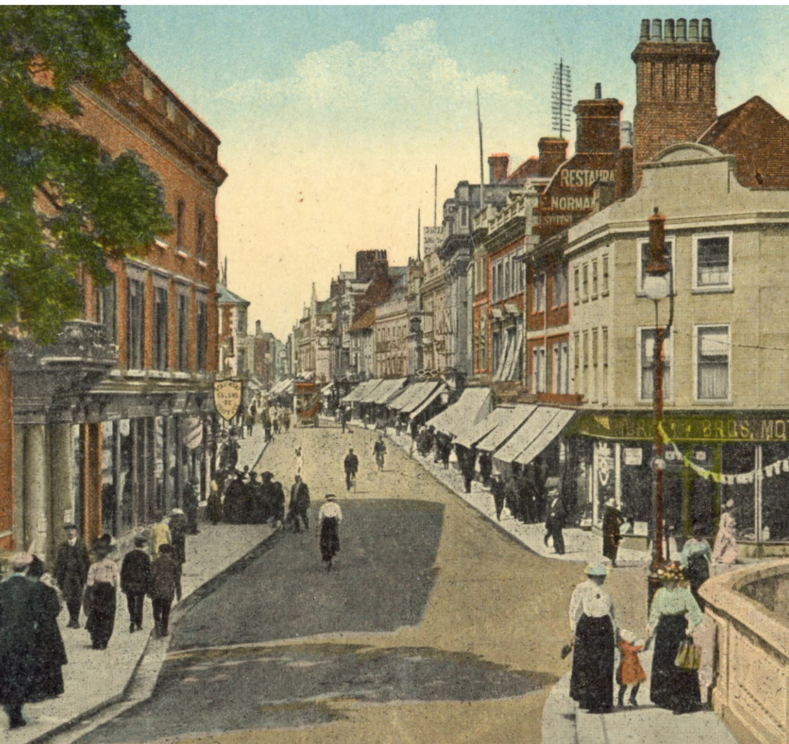
High Street, Bedford, about 1919