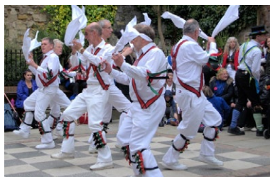
Redbornstoke Morris Team, Jack 'O the Green Festival, Hastings, 2015

The last forty or so years have seen great shifts in what most people think of as a fixed and unchanging English tradition. This display traces the impact of innovation and change on tradition through the story of two local Morris teams: Redbornstoke Morris and Bedfordshire Lace Morris. See original objects and costumes connected with these teams and discover archive photographs of their local performances over the years.