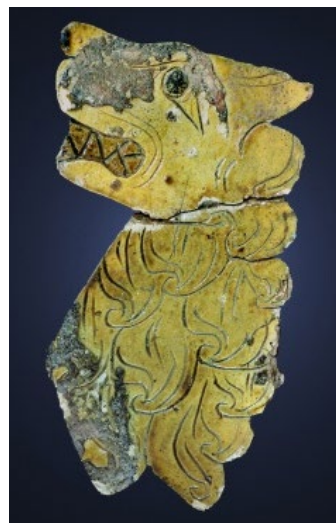
Early 14th century floor tile in the shape of a Lion's head, Warden Abbey, courtesy of the Southill Estate

The reconstruction illustration by Peter Dunn based on this work will be on display with a selection of archaeological artefacts recovered from excavation at Warden Abbey. commissions and iconic linocuts.