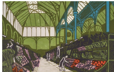
Edward Bawden (1903–1989) The Floral Hall , Covent Garden, 1967 © The Edward Bawden Estate

Architecture is one of the most prominent and reoccurring subjects in Edward Bawden's work. Selected from the Cecil Higgins Art Gallery collection and home of the Edward Bawden archive, explore his passion for architecture through prints, advertising campaigns and private commissions. Includes architecturally inspired wallpaper designs, nostalgic pre-war vignettes of rural houses, 1930s modernist architecture and Victorian ironwork structures, some of which have never before been on public display.