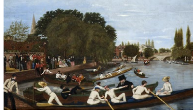
Unknown Artist, Bedford Regatta, 1851