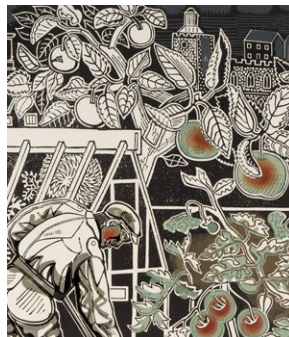
Edward Bawden (1903-1989) Autumn, 1960

Drawn exclusively from the Edward Bawden archive, view early wallpaper designs, advertising commissions and iconic linocuts.