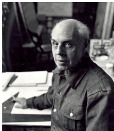
Edward Bawden in his Studio, image commissioned by Braintree and Witham Times.

£12.90, concessions £10.35 – Booking Essential