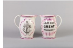
Long Live Great Bardfield, 2023 by Sussex Lustreware

Join the Keeper of Fine and Decorative Art for a half hour tour of some of the highlights of Edward Bawden & Me.