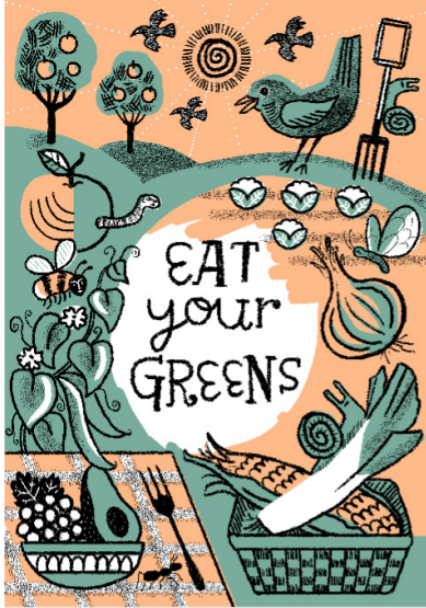
Eat Your Greens, 2023 by Katie Allen

As part of the Edward Bawden & Me celebrations, we asked the Circus of Illustration, a collective of Bedford based artists, to commission new illustrations inspired by the Edward Bawden Archive. The four committee members and eight up-and-coming artists have each produced a work shown alongside the work by Edward Bawden that inspired it.