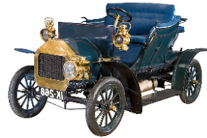
Adams Mail Phaeton Car, 1907

Join the Keeper of Social History and explore Bedford's transport heritage including Airship R101, Bedford Times coach, Dan Albone cycle, the coming of the railways and the Adams car.