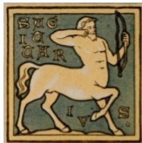
William Burges (1827 – 1881), Zodiac Tile – Sagittarius

Take a closer look at some of the furniture and objects by the eccentric Gothic designer, William Burges. Time: 30 mins Cost: £3.50 (Concessions £2.95)