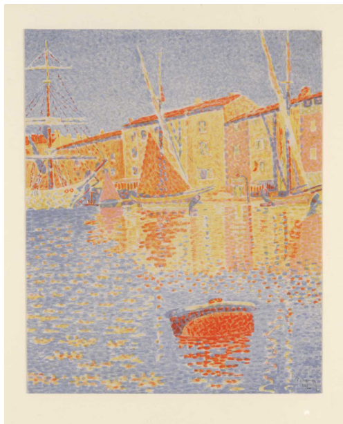
La Bouée 1894 by Paul Signac, lithograph on paper

Wixamtree and Connections Galleries – Free Entry