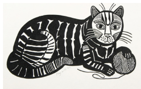
Play with Me, 1981 by Edward Bawden ©The Estate of Edward Bawden

£3.50, concessions £2.95 – Booking Essential