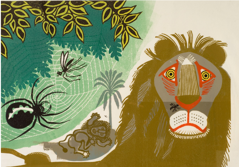
The Gnat and the Lion, 1970 by Edward Bawden ©The Estate of Edward Bawden

Some of the biggest names in British art, illustration, ceramics and textiles come together in this eclectic exhibition to celebrate the work of printmaker, illustrator, watercolourist and designer Edward Bawden (1903–89).