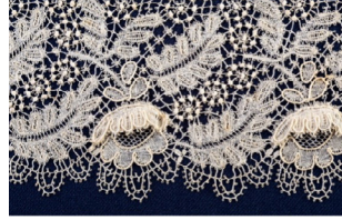
Bedfordshire Lace Edging, Rose petal design, Late 19th Century, Lester Lace Collection, BML68a

Time: 1½ hours Cost: £12.90 per person (concessions £10.35)