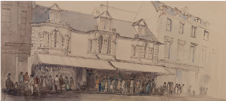
Sell and Willshaw's Shop Front, Bedford 1930 by Albert Richardson