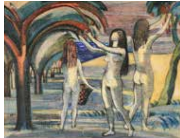
Paul Nash (1889-1946) The Fruit Pickers, c.1916