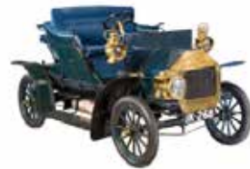
Adams Mail Phaeton Car, 1907