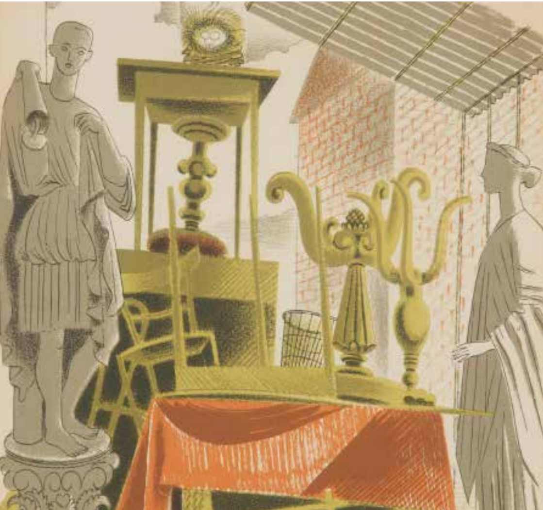
Eric Ravilious (1903 – 1942), Second-hand Furniture and Effects, 1938 © The Ingram Collection of Modern British and Contemporary Art. Photographer © John-Paul Bland