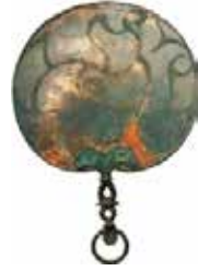
Bronze mirror found at Old Warden, Bedfordshire, c.1st century BCE

Email Matthew.Fittock@stalbans.gov.uk to book your place. Please note that the dates may be subject to cancellation. To find out more visit the website www.finds.org.uk