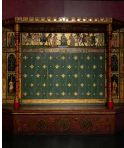
William Burges (1827 – 1881), Zodiac Settle , 1869-70

Becoming a Friend not only supports the museum but offers a range of other benefits, including discounts in the shop and café, the chance to join visits abroad, and access to a catalogue of online talks.