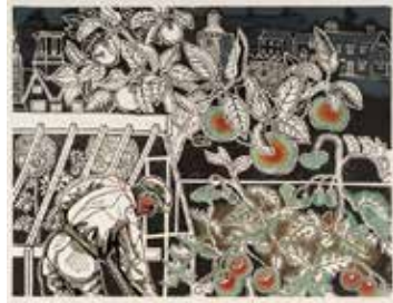
Edward Bawden (1903-1989), Autumn, 1960

Explore Edward Bawden's love of plants and gardens in this exhibition of all things botanical. Drawn exclusively from the Edward Bawden archive, view early wallpaper designs, advertising commissions and iconic linocuts.