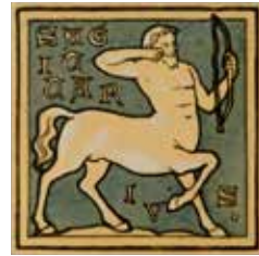
William Burges (1827 – 1881), Zodiac Tile – Sagittarius