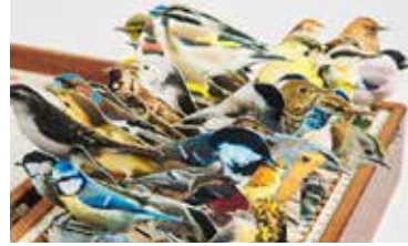
Fieldwork 1: Passerine Small Birds

that have lived within Greensand Country.