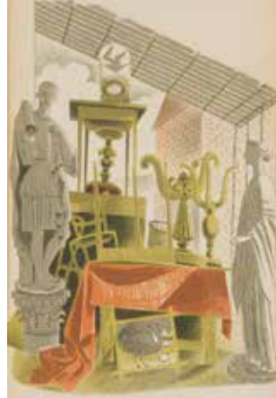
Eric Ravilious (1903 – 1942), Second-hand Furniture and Effects, 1938 © The Ingram Collection of Modern British and Contemporary Art. Photographer © John-Paul Bland

Spread across three galleries, the first large-scale exhibition since the reopening of The Higgins Bedford in 2013, brings together almost one hundred works from two important collections: Bedford's own Cecil Higgins Collection and the Ingram Collection of Modern British and Contemporary Art. Visitors will find sculpture, paintings and works on paper by some of the biggest names in British art, including Eric Ravilious, David Hockney and Elisabeth Frink. Themes of the exhibition features self-portraits and the evolution of landscape painting. Changing Times is curated by James Russell, previously curator of Eric Ravilious and Edward Bawden at Dulwich Picture Gallery.